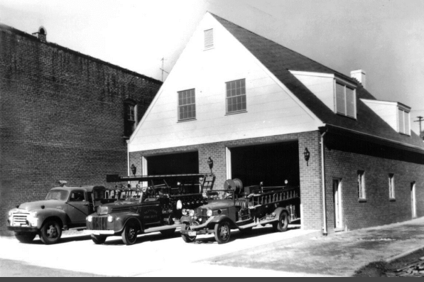
Historic Altavista Fire Station in Downtown Altavista.

“The Town of Altavista is proud to have the Spark Innovation Center as part of its ongoing efforts to carry on its legacy of building great businesses, in support of economic security for future generations.”