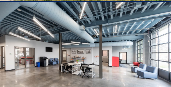
The Spark Innovation Center opened in January 2023 offering 3,500 sq feet of co-working and makerspace. ( sparkinnovationcenter.com )