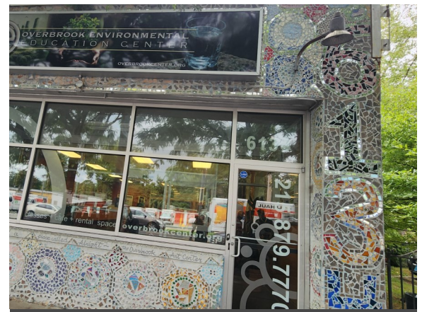
Outside Front View of OEEC

In 2022, JASTECH received Land Revitalization Technical Assistance (LRTA) to help develop a site reuse assessment and concept. The assistance included performing a market study and identifying funding resources for site development. Ultimately, the assistance provided a plan towards the site's redevelopment of senior affordable housing, public event space, a health center, and expansion of the education center. An approach to the Farmacy Redevelopment was also provided, outlining the steps to bring the idea to life. Once completed, the Farmacy will serve as a wellness center for the community, offering healthy, organic food to encourage healthier living.