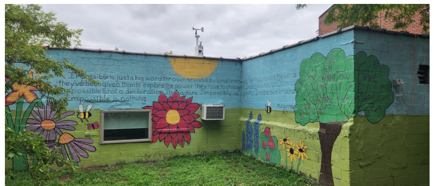
Motivational mural of Muhammad Ali’s “Impossible is Nothing” quote on rear of OEEC building.