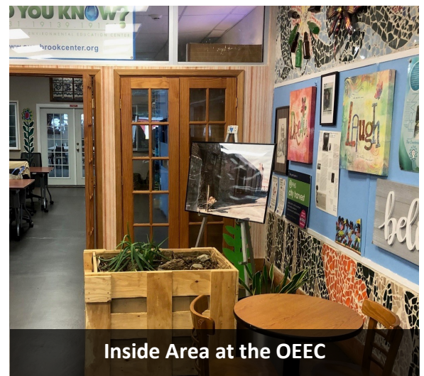
Inside Area at the OEEC