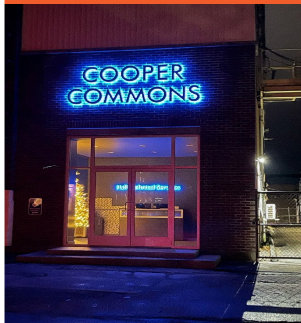
Outside view of the redeveloped Cooper Commons facility located in Grove City, PA.