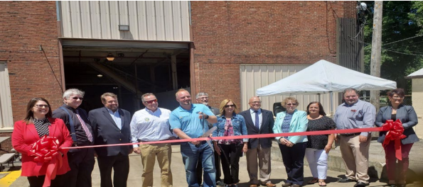
Ribbon cutting in Summer 2021 at the new Hall Industries production facility at Cooper Commons with public officials from Mercer County and Grove City, along with representatives from Hall Industries and PNDC.

“It is gratifying to see this happening, as we all knew folks that used to work here.”