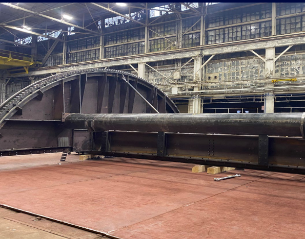
Rotary rail car dumpers are an example of what is being manufactured in the redeveloped Cooper Commons.