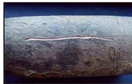
Picture of a Scratch on a Lead Service Line

Requirements addressing lead in water include specific provisions in: