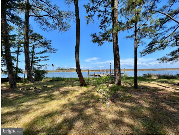
Clean Air, Shade, Sun