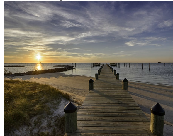
Scenic Views/ Ecosystem Health