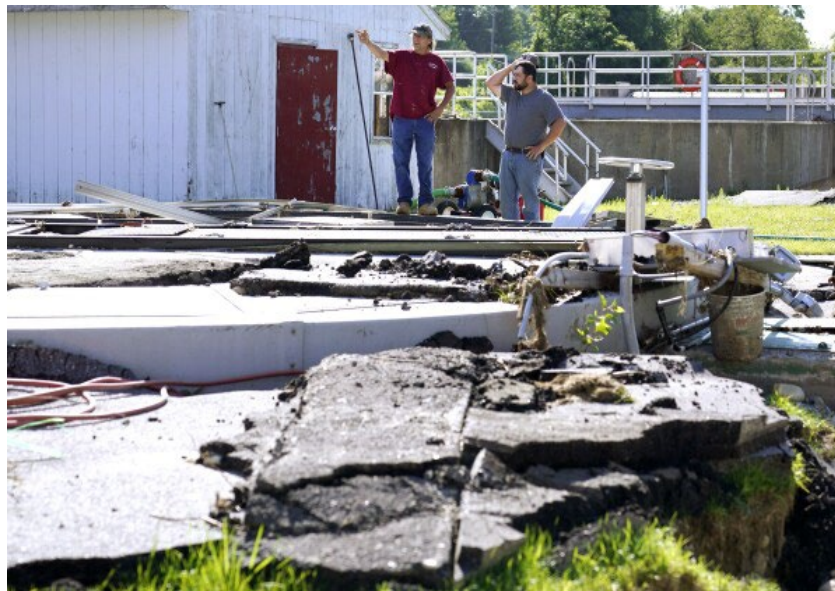
Figure 2: Ludlow Wastewater Treatment Plant (photo August 2, 2023, taken after July storm event) 16

[t]he facility that keeps the village’s drinking water safe was built at elevation and survived. But its sewage plant fared less well. Flooding tore through it, uprooting chunks of road, damaging buildings and sweeping sewage from treatment tanks into the river. Even [over three weeks after the storm event] the plant can only handle half its normal load. 15