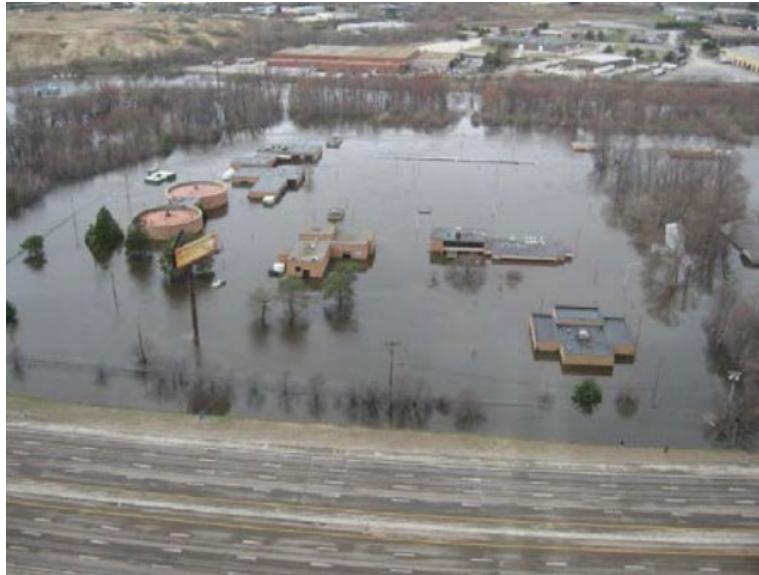
Figure 1: The flooded Warwick wastewater facility on Wednesday, March 31, 2010.

with its permit limits for a period of about 80 days. 11 Due to this flooding, the facility updated their flood protection plans based on local storm and flooding data and implemented improvements for the WWTS, including raising the levee to protect the WWTS from inundation caused by a 500-year flood event. 12