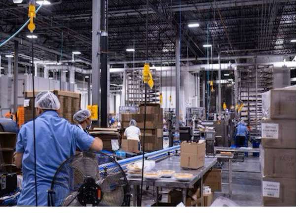
A look inside the baking facility.

[The company] has deep roots in the City of Worcester and we are pleased to have played a role in facilitating their expansion here in their hometown. The new 50,000 square-foot facility in the South Worcester Industrial Park would not have been possible without the support of the U.S. EPA Brownfields Program and we look forward to continued success and partnership with the EPA in redeveloping brownfields sites across the city.