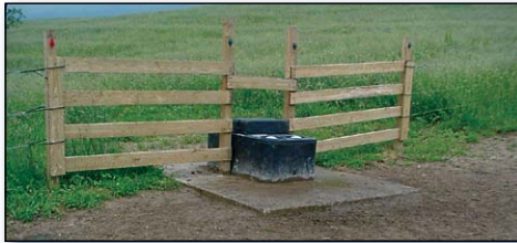
Figure 2. Willis River landowners installed numerous BMPs, such as stream crossings (top) and alternative water sources (bottom).

alternative water systems, composting facilities, animal waste storage, livestock stream exclusion with grazing land protection systems, and riparian buffers. For example, landowners added 168,960 feet (32 miles) of fencing to exclude approximately 3,944 head of livestock from access to streams or farm ponds—that established more than 129 acres of buffers. Landowners also improved approximately 1,780 acres of pastureland. For the residential BMP program, PFSWCD helped homeowners implement numerous septic projects to date, including 14 septic tank pump outs, four septic system repairs, and four septic system replacements. Of the four replacements, one is complete and three more are under contract.