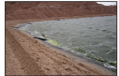
Navajo Nation's Tuba City Lagoon System

An emerging contaminant (EC) in wastewater refers to substances and microorganisms, including manufactured or naturally occurring physical, chemical, biological, radiological, or nuclear materials known or anticipated in the environment that may pose newly identified or re-emerging risks to human health, aquatic life, or the environment. Consumers can find ECs in personal care products, pharmaceuticals, industrial chemicals, pesticides, and microplastics.