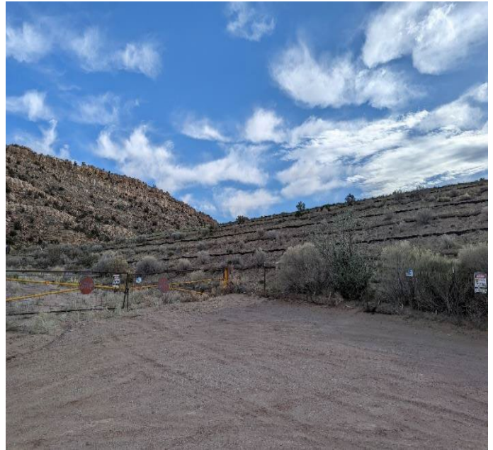
Waste rock pile at the Quivira Mines CR-1 area.

EPA and Navajo Nation EPA are holding public meetings to discuss cleanup options. In Spring 2024, the Agencies plan to release a comparison of cleanup options for the final response action for the Quivira Mines called the Engineering Evaluation and Cost Analysis (EE/CA) for public comment. EPA will open a 60 day public comment period and hold public meetings to present the recommended cleanup option to the communities. EPA expects the cleanups to begin around 2025 to 2027, depending on the cleanup option selected.