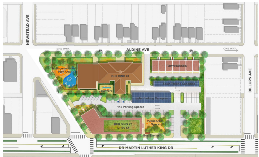
Proposed site reuse plan for the Marshall School in St. Louis, Missouri.

Solution: St. Louis is severely impacted by increasing temperature due to climate change, and coupled with the amount of paved surfaces, the Marshall School brownfield site contributes to the urban heat island effect in the community. The St. Louis Development Corporation is interested in utilizing the shuttered school as a future affordable housing complex and incorporated robust green infrastructure techniques into the plan to reduce the experience of heat on the site. The plan calls for a green roof on the proposed new construction, a significant increase of vegetation and tree canopy, especially around the bus stop where residents may be waiting, and solar parking canopies.