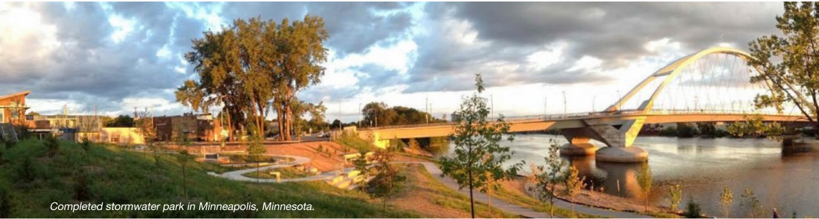
Completed stormwater park in Minneapolis, Minnesota.

Taking action by adding resilient features, as shown in these two case studies, can help a community reduce risks and negative economic impacts of climate change and avoid future costs.