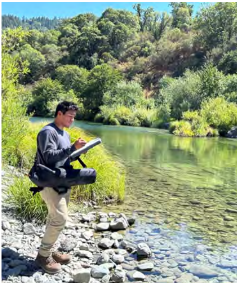
Water quality sampling at the Sherwood Valley Band of Pomo Indians Reservation

Starting on April 5, 2022 , the Section 106 Program received a Class Exception that waives the tribal program match requirement for new grants and supplemental awards made thereafter.