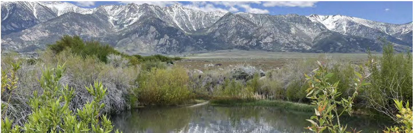
Confederated Tribes of the Goshute Reservation

Download Guidance: epa.gov/water-pollution-control-section-106-grants/clean-water-act-section-106-tribal-guidance