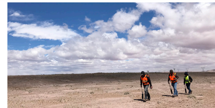
Phase 2 Trust contractors conducting field survey of a background location in the Western AUM area.

U.S. Environmental Protection Agency (USEPA), in partnership with the Navajo Nation EPA (NNEPA), has identified 523 AUMs on the Navajo Nation. Of those 523 AUMs, 111 are in the Western AUM Region. Funds are available to begin the cleanup process at 43 mines in the Western AUM Region. USEPA continues to look for companies responsible to assess and clean up the remaining mines in this region.