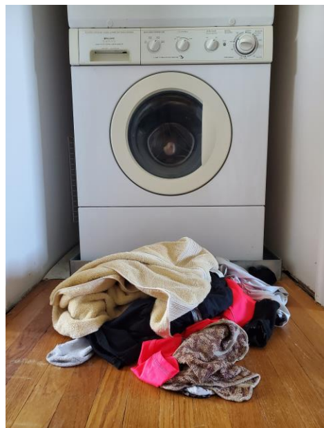
Figure 3: Gabriella Neusner

We are only beginning to understand the scale, the sources, and the risks of microfiber pollution. However, we know enough to start addressing the problem now, starting with our home laundry. By making these relatively simple changes, we can do a lot to reduce the flow of plastic into the environment.