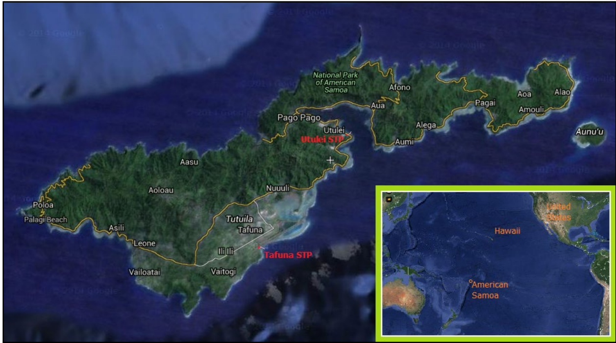
Figure 1: Map of Tutuila Island, American Samoa. Utulei STP is the northernmost of the two treatment plants on the main island, indicated by a red dot