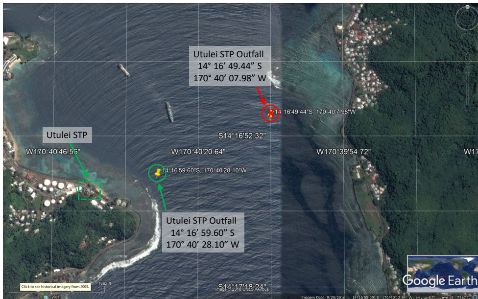
Figure 2: Map of Utulei STP and outfall (locations in green). Reprinted from discharger's 2018 submission of revised outfall coordinates. Diffuser location did not change, but use of old coordinate system (NAD 27) led to inaccurate (red) position relative to physical coastlines.