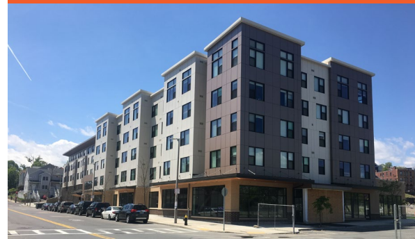
Figure 2: Bartlett Station Apartments

Current Use: Bartlett Place – urban mixed-use development