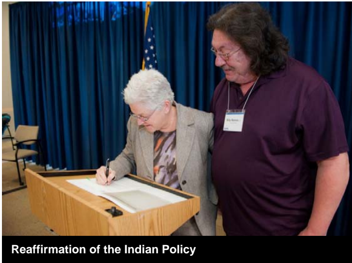
Reaffirmation of the Indian Policy

environmental laws consistent with the federal trust responsibility, the government-to-government relationship, and the EPA Indian Policy.