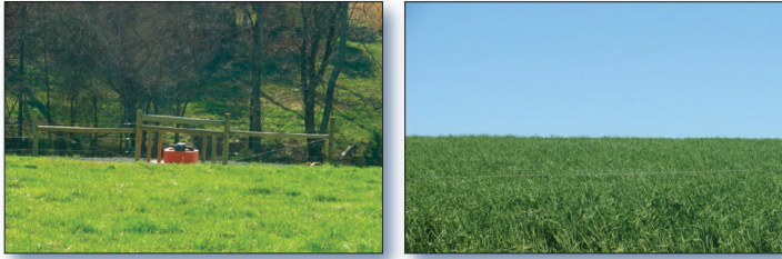
Figure 2. BMPs installed in the Blackwater River watershed include alternative livestock watering systems (left), and small grain cover crops (right).